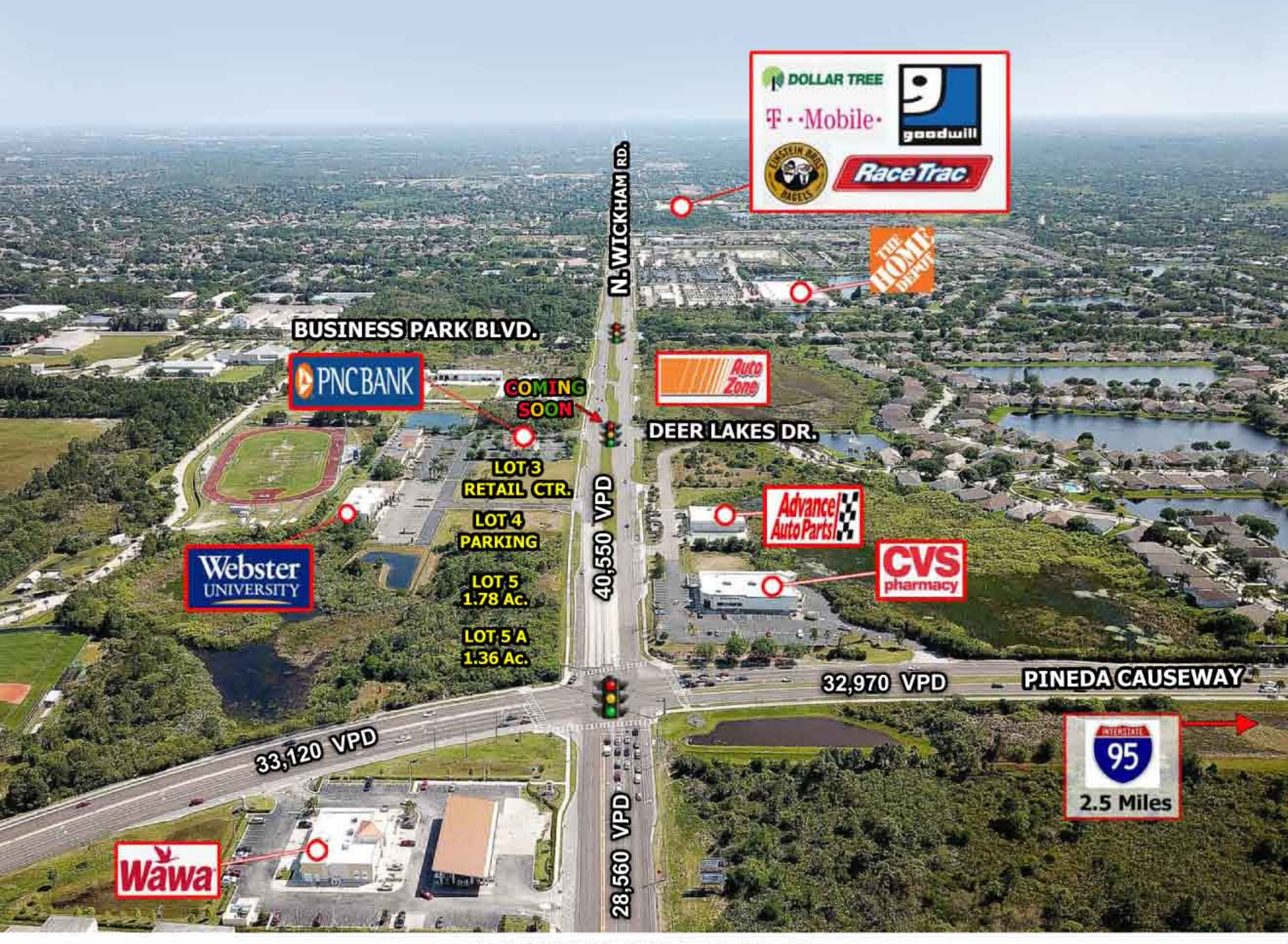
LOOKING SOUTH 4.7.19