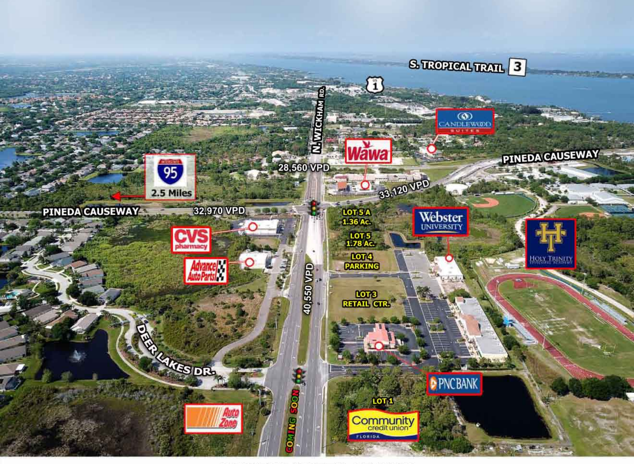
LOOKING NORTH 4.7.2019