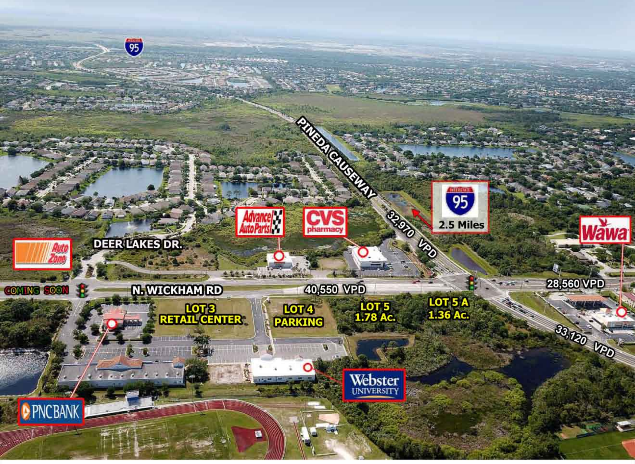
LOOKING WEST 4.7.2019