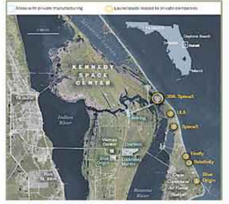
PRIVATE LAUNCH PADS AT THE CAPE

Outside the gates of the Kennedy Space Center, developers are building residential communities up and down the coastline. The unemployment rate dropped to below 4 percent earlier this year. The tax base has bloomed with monthly taxable sales rebounding from a low of nearly $450 million in 2010 to over $850 million last year. And housing prices are back where they were before the recession.