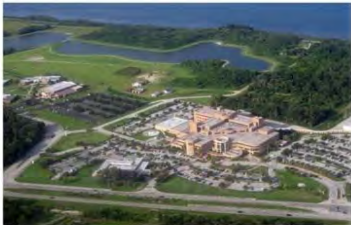
Parrish Medical Center's Titusville, Florida Campus